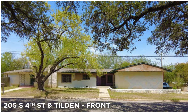
205 S 4 TH ST & TILDEN - FRONT