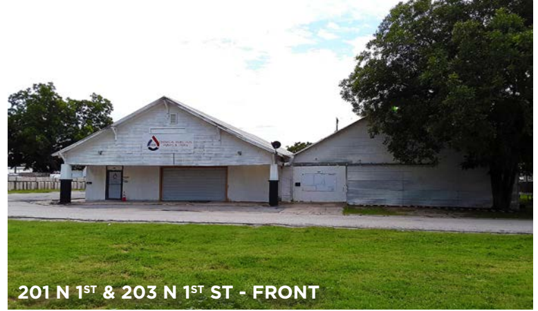
201 N 1 ST & 203 N 1 ST ST - FRONT