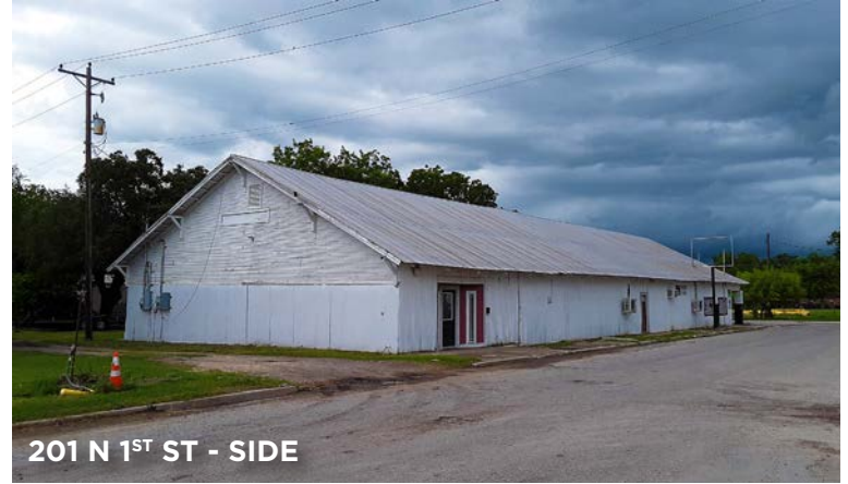
201 N 1 ST ST - SIDE