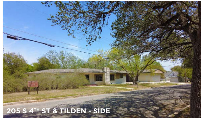
205 S 4 TH ST & TILDEN - SIDE