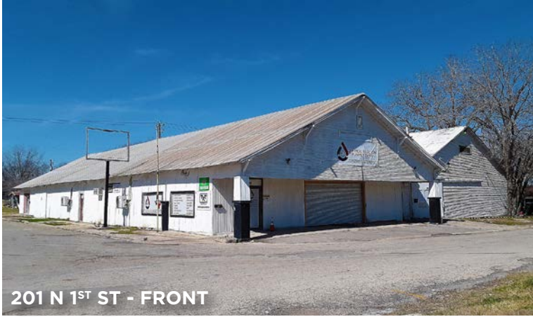
201 N 1 ST ST - FRONT