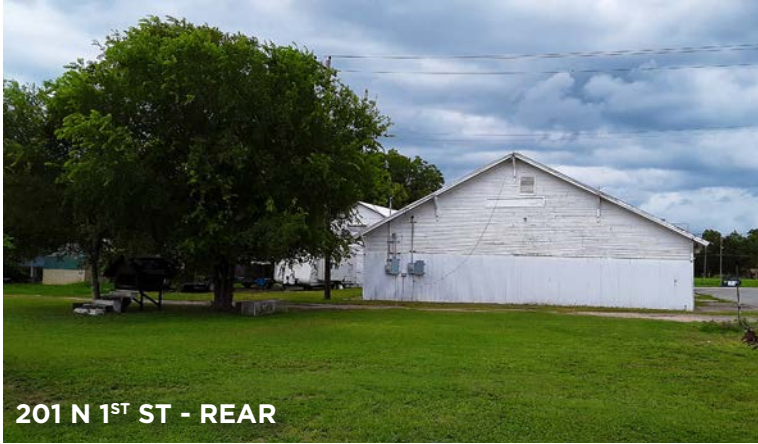
201 N 1 ST ST - REAR