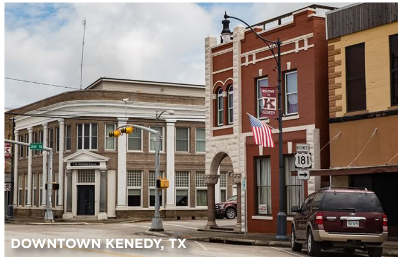
DOWNTOWN KENEDY, TX